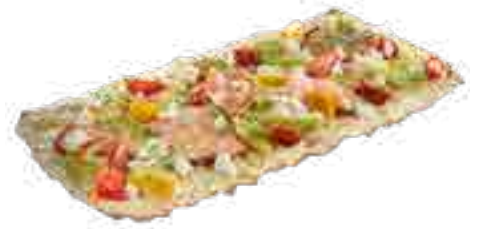
CAULIFLOWER HERB FLATBREAD 4" X 12" (3 BAGS OF 20; 60 CT) - 020412-0269