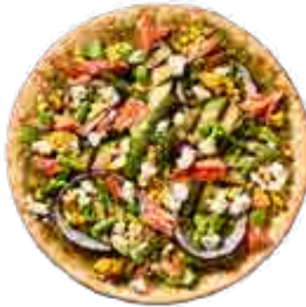
GARLIC, HERB & CHEESE CAULIFLOWER GLUTEN-FREE 10" (2 BAGS OF 12; 24 CT) - 020043-0269 12" (2 BAGS OF 12; 24 CT) - 120043-0269