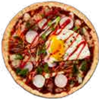
CHEEZY GLUTEN-FREE 10" (2 BAGS OF 12; 24 CT) - 020041-0269 12" (2 BAGS OF 12; 24 CT) - 120041-0269

IT'S HERE! INQUIRE ABOUT OUR NUT-BASED CRUSTS