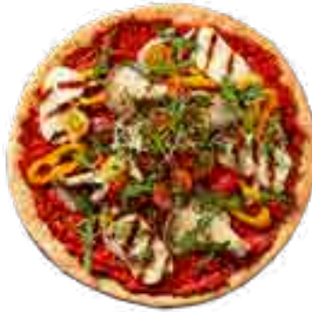
GLUTEN-FREE CAULIFLOWER 10" (2 BAGS OF 12; 24 CT) - 020040-0269 12" (2 BAGS OF 12; 24 CT) - 120040-0269