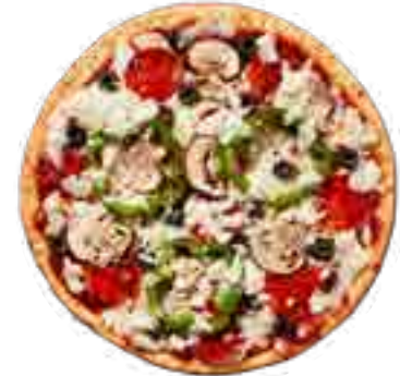
CHEEZY CAULIFLOWER GLUTEN-FREE 10" (2 BAGS OF 12; 24 CT) - 020042-0269 12" (2 BAGS OF 12; 24 CT) - 120042-0269