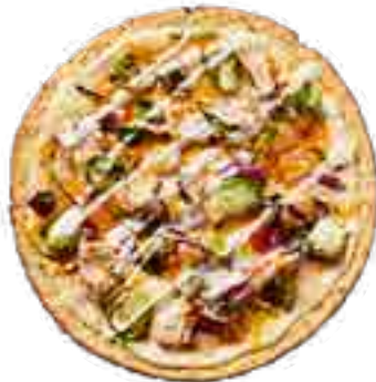
CHEEZY BROCCOLI GLUTEN-FREE 10" (2 BAGS OF 12; 24 CT) - 020044-0269 12" (2 BAGS OF 12; 24 CT) - 120044-0269